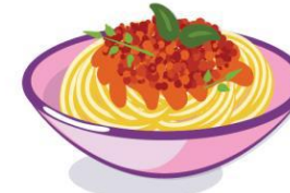
pasta served with a sauce of the day