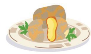
freshly baked jacket potato