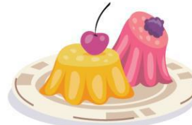
jelly, fruit and yoghurts